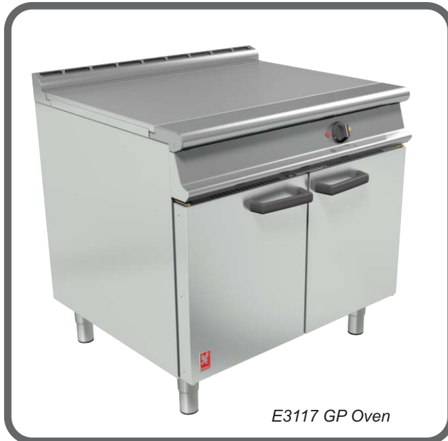
E3117 GP Oven