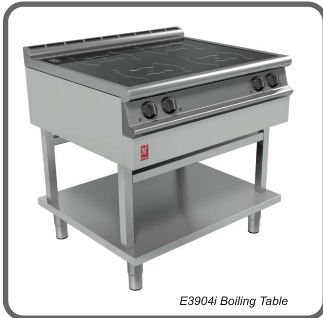
E3904i Boiling Table