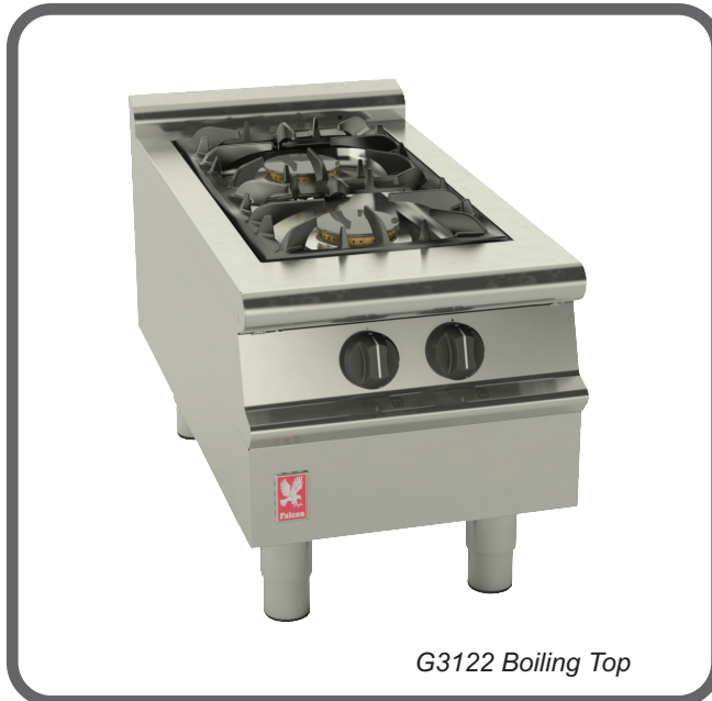
G3122 Boiling Top