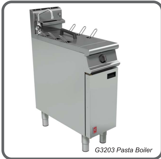
G3203 Pasta Boiler